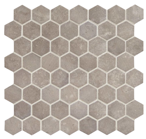
ARTIFACT GRAY VH07