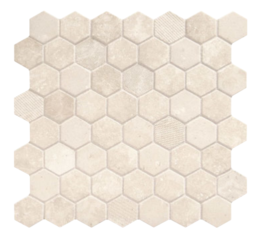
ANTIQUE BEIGE VH05