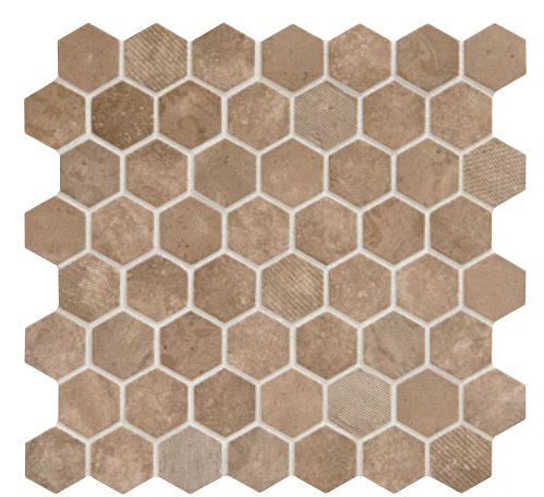
RELIC UMBER VH09