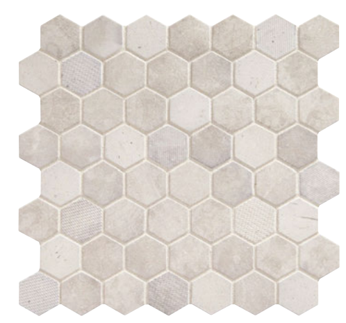
WISDOM WHITE VH06