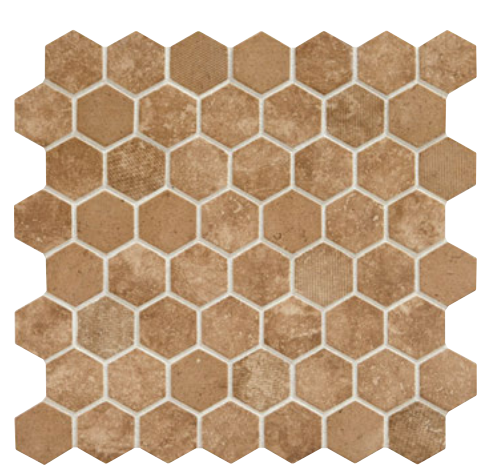
LEGACY SEPIA VH08